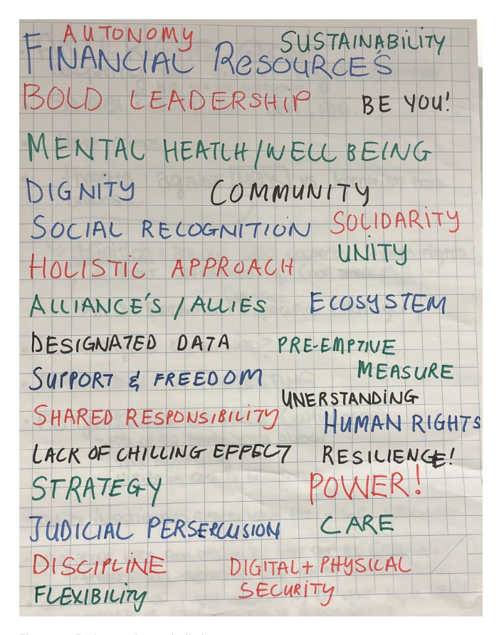
Figure 2 – Brainstorming on holistic protection during the April Roundtable Meeting in Brussels

"a set of strategies, measures and actions that aim at protecting both a collective actor (an organisation, a community, a group) and the individuals who are part of it, and that are or may be at risk due to their human rights defence activities. Thus, collective protection goes beyond the protection of community or group leaders who may be, in principle, the main target of attacks. It also goes beyond granting individual security measures to each member of a group or community".