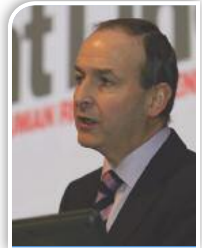
Micheál Martin, Minister for Foreign Affairs

Denis O'Brien introduced Micheál Martin, Ireland's Minister for Foreign Affairs, who praised human rights defenders. Paraphrasing the Irish poet Seamus Heaney, he said, "you are dual citizens of the republic of conscience". 2 Affirming the Government's support for Front Line's work on security and internet security, the Minister stressed Ireland's commitment to human rights protection. He underlined the potential of the EU Guidelines on Human Rights Defenders and the work of the EU Human Rights Working Group Task Force. He indicated the importance of the role of the Human Rights Council, and the need to work across regional divides to address human rights issues. He affirmed that Ireland raises the issue of human rights defenders at every Periodic Review, will defend the Special Procedures, and continues to support the work of the UN Special Rapporteur on the situation of human rights defenders. He drew attention to the Dublin Statement, recently published following a conference of experts, which outlines how the valuable work of the Treaty Bodies could become more efficient. 3