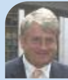
Denis O'Brien (Chairman) Denis O'Brien is Chairman of the Digicel Group. Mr O'Brien is one of Ireland's leading

entrepreneurs with extensive investments across several sectors. He founded the Communicorp Group which has a portfolio of media and broadcasting-related companies in Ireland and seven other European countries. In 2000 he established The Iris O'Brien Foundation to assist disadvantaged communities in Ireland and internationally.