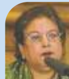
Hina Jilani is an internationally known human rights lawyer and advocate for human rights defenders. She was the Special Representative of the

world for all ahead of their own safety. In 2001 she set up Front Line, the International Foundation for the Protection of Human Rights Defenders to provide round the clock practical support and deliver fast and effective action on behalf of human rights defenders at risk.