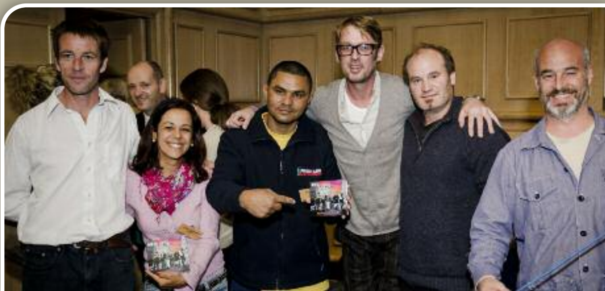
Some delegates with members of the band Kila, who performed at the opening of the Dublin Platform