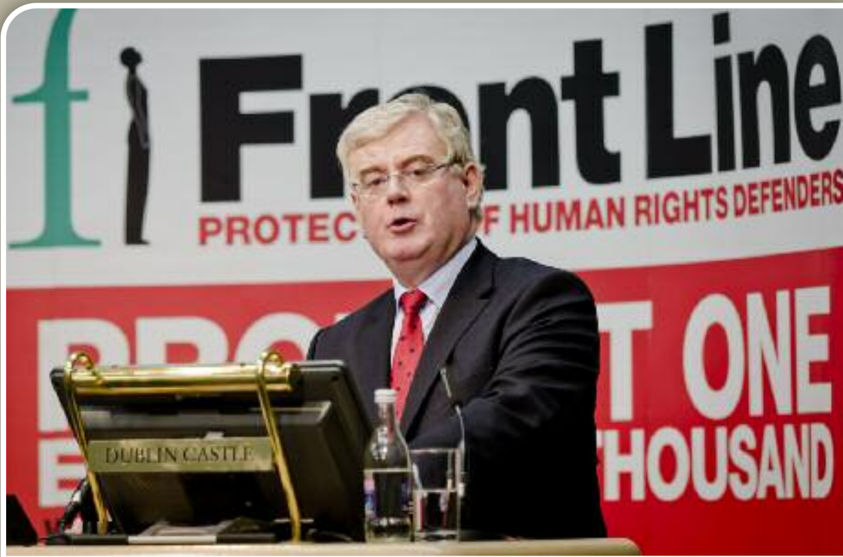
Tánaiste and Minister for Foreign Affairs & Trade, Mr. Eamon Gilmore T.D.

Eamon Gilmore TD, Tánaiste and Irish Minister of Foreign Affairs & Trade