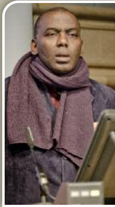
Biram Dah Abeid, Mauritania